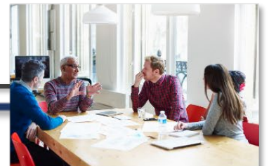
GV Professional Services